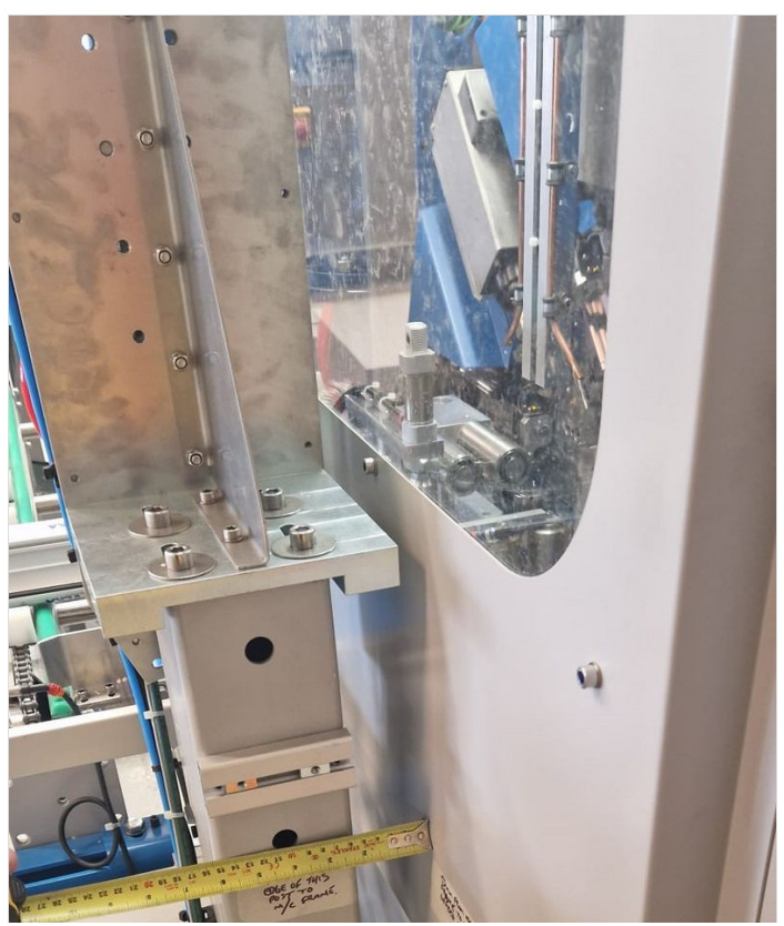
Page 3 / 10