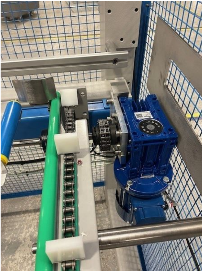
Size of this preview:450 × 600 pixels. Original file (480 × 640 pixels, file size: 122 KB, MIME type: image/jpeg) ZX5_MH_Infeed_Basic_IO_Test_and_Setup_Chain_Clutch