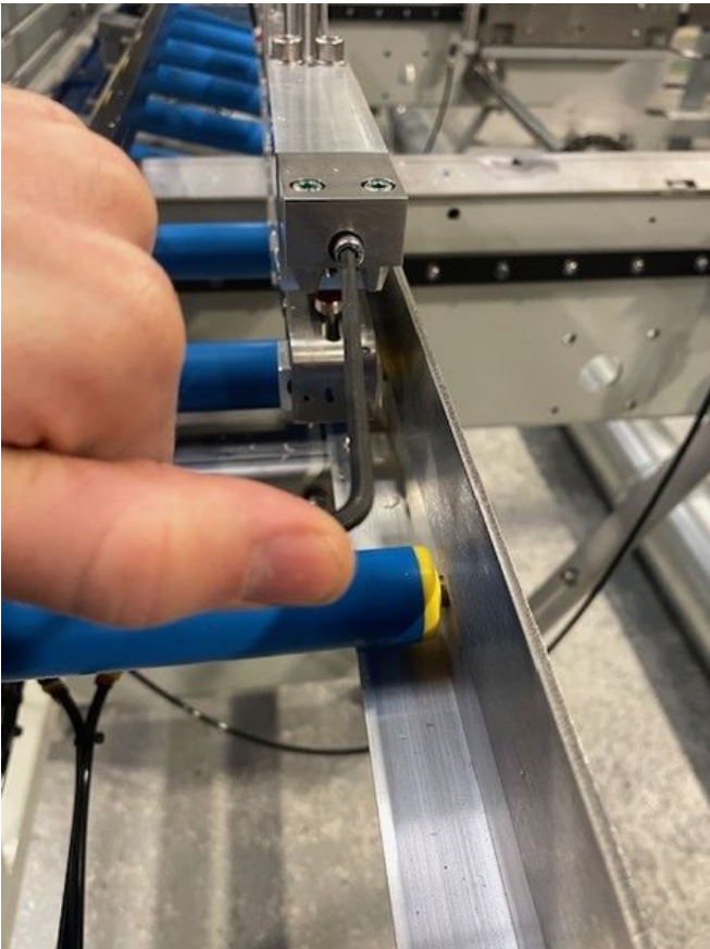
Size of this preview:450 × 600 pixels. Original file (480 × 640 pixels, file size: 71 KB, MIME type: image/jpeg) ZX5_Clamp_and_Gripper_Height_Changes_for_Tall_Profile_7