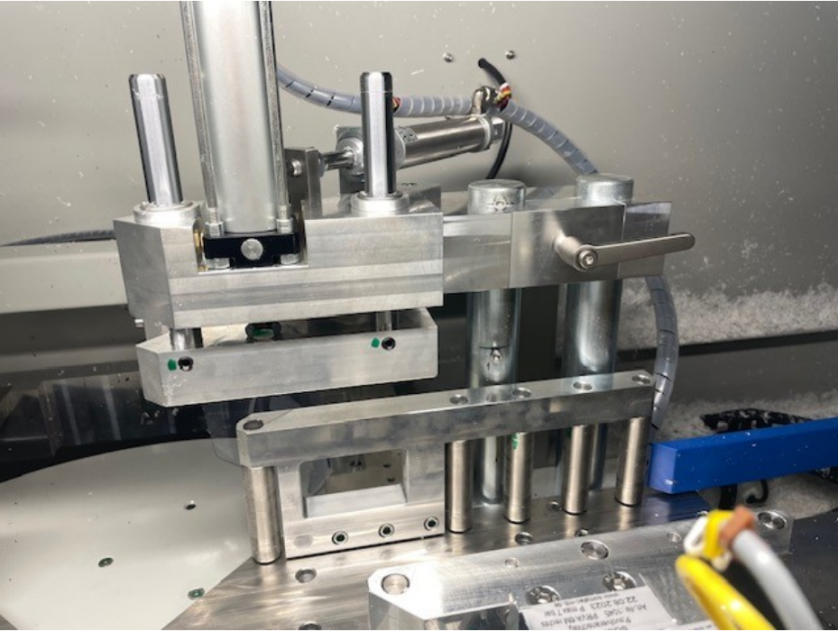
No higher resolution available. ZX5_Clamp_and_Gripper_Height_Changes_for_Tall_Profile_4.jpg (640 × 480 pixels, file size: 76 KB, MIME type: image/jpeg) ZX5_Clamp_and_Gripper_Height_Changes_for_Tall_Profile_4