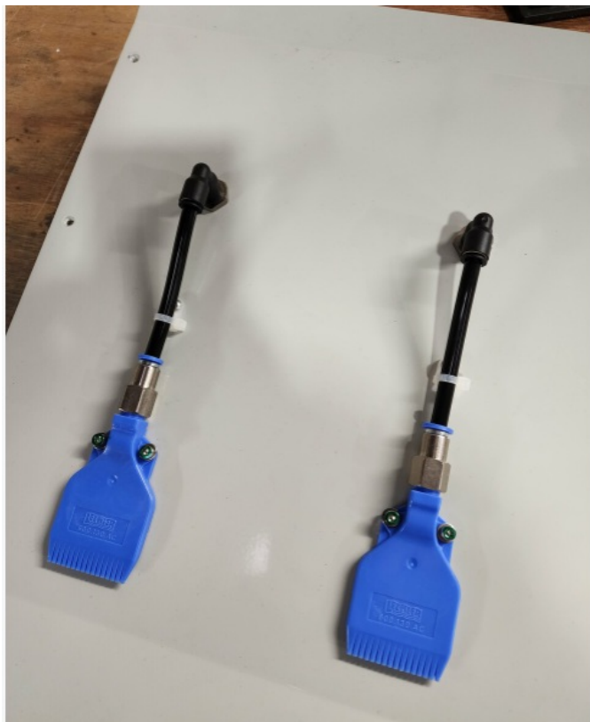
No higher resolution available. R0015084_Bench_assemble_and_Drill_Off_Swarf_chutes_Screenshot_2024-03-12_084331.png (485 × 590 pixels, file size: 285 KB, MIME type: image/png) R0015084_Bench_assemble_and_Drill_Off_Swarf_chutes_Screenshot_2024-03-12_084331