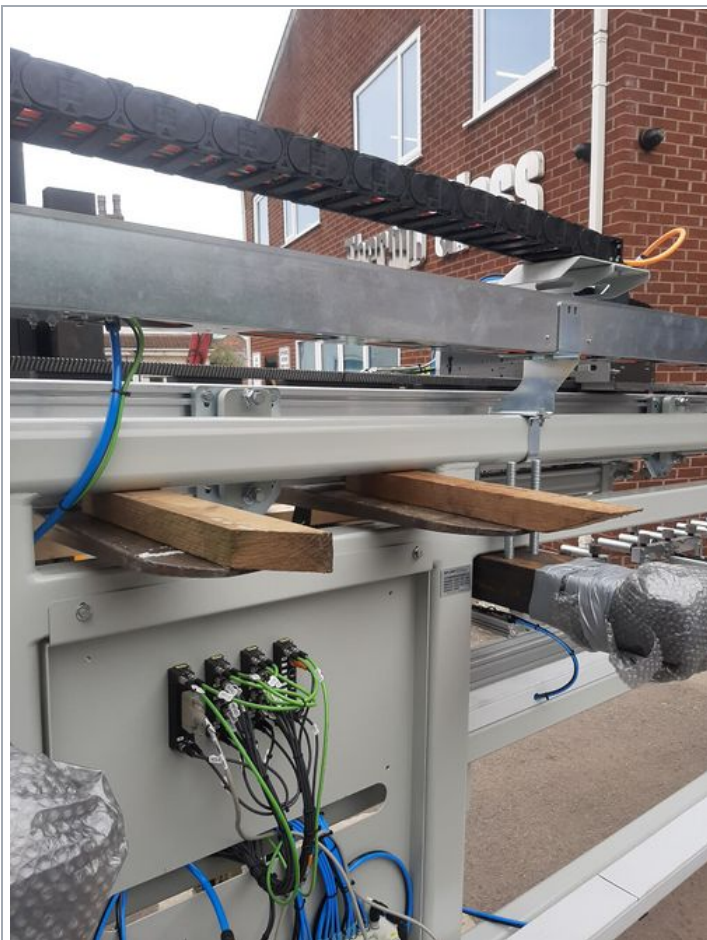
Solution for forks that may not fit