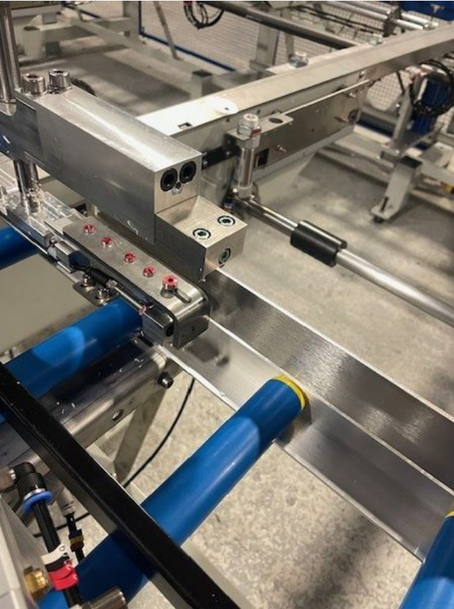
Size of this preview:450 × 600 pixels. Original file (480 × 640 pixels, file size: 102 KB, MIME type: image/jpeg) ZX5_Clamp_and_Gripper_Height_Changes_for_Tall_Profile_2