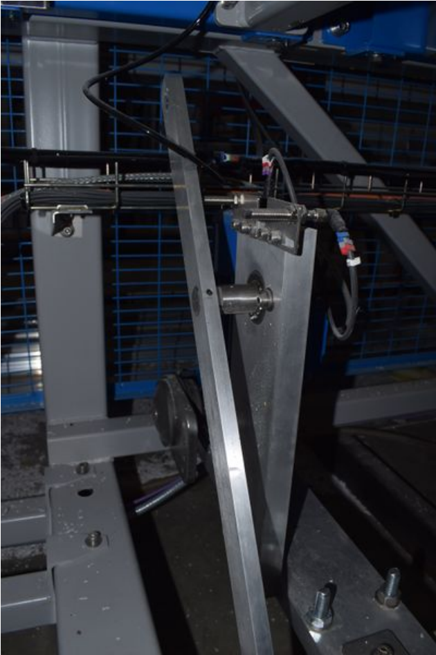
Size of this preview: 400 × 600 pixels. Original file (4,000 × 6,000 pixels, file size: 7.12 MB, MIME type: image/jpeg) Fitting_Zx5_Crank_Upgrade_DSC_0268